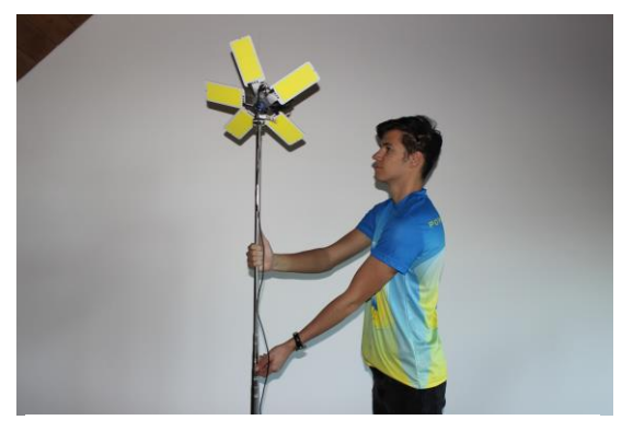
Rotating clockwise fixes the selected height.